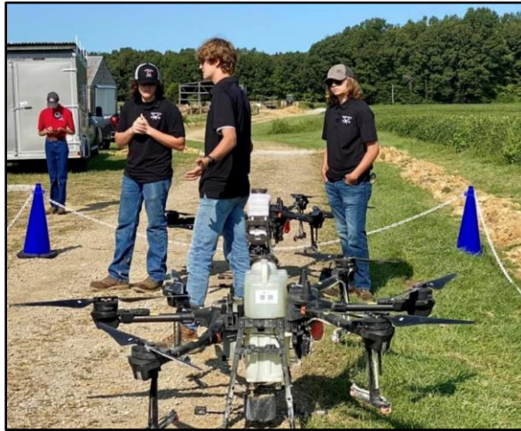
Midwest Air, LLC will demonstrate the DJI Agras drone outfitted for seeding and spraying insecticide and nutrients.

When Lieutenant John Macready climbed in to an army surplus biplane in 1921 near Troy, Ohio, he became the world's first "crop duster." Now, a hundred years later and a hundred miles away, innovation is closer to the ground but still reaching new heights. Large commercial drones are now being used for aerial spraying and aerial seeding. As the district strives to lead in ag innovation, we are hosting a free workshop at Noon on Thursday, March 30th at the Ross County Fairgrounds. Peebles based company Midwest Air will demonstrate their agricultural drones outfitted with compartments for seeding & spraying. Ross SWCD has flown drones mainly for imaging since 2016 and the district will display our drone equipment plus maps drawn with drone data. There is no cost to attend. An RSVP is requested. Call 740-772-1711 or email admin@rosscountyswcd.org . The workshop and demonstration are free and open to the public and is scheduled rain or shine.